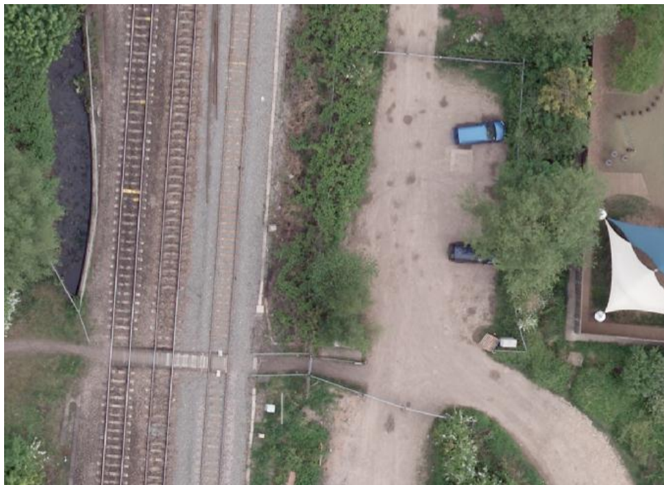
Figure 1: Aerial photograph of informal parking area adjacent to Aristotle Lane level crossing.